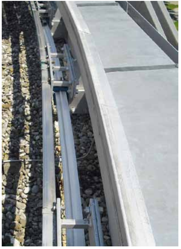
SACL system application