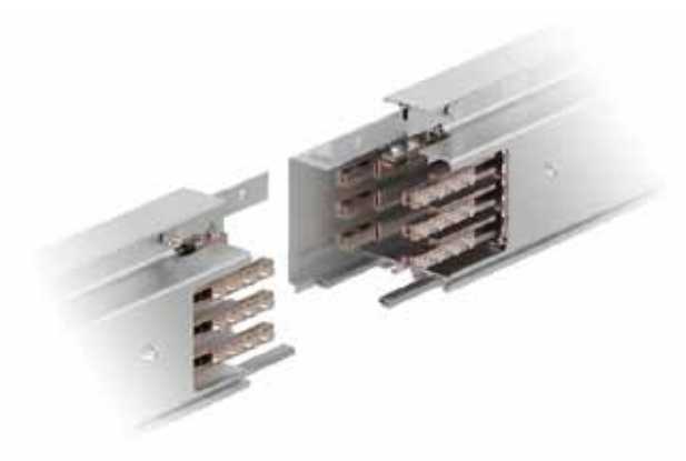
Conductor bar connection, screwed version

We offer our SACL series in preassembled 4-meter lengths. In addition to the conductor bar with current collecting trolleys, mounting systems for installations in indoor and outdoor areas, etc. a comprehensive range of accessories is available.