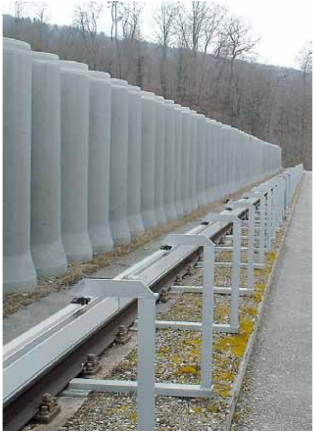
SACL system application